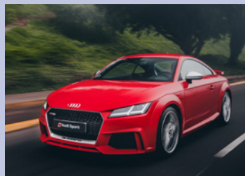
Motor vehicles: $65,000